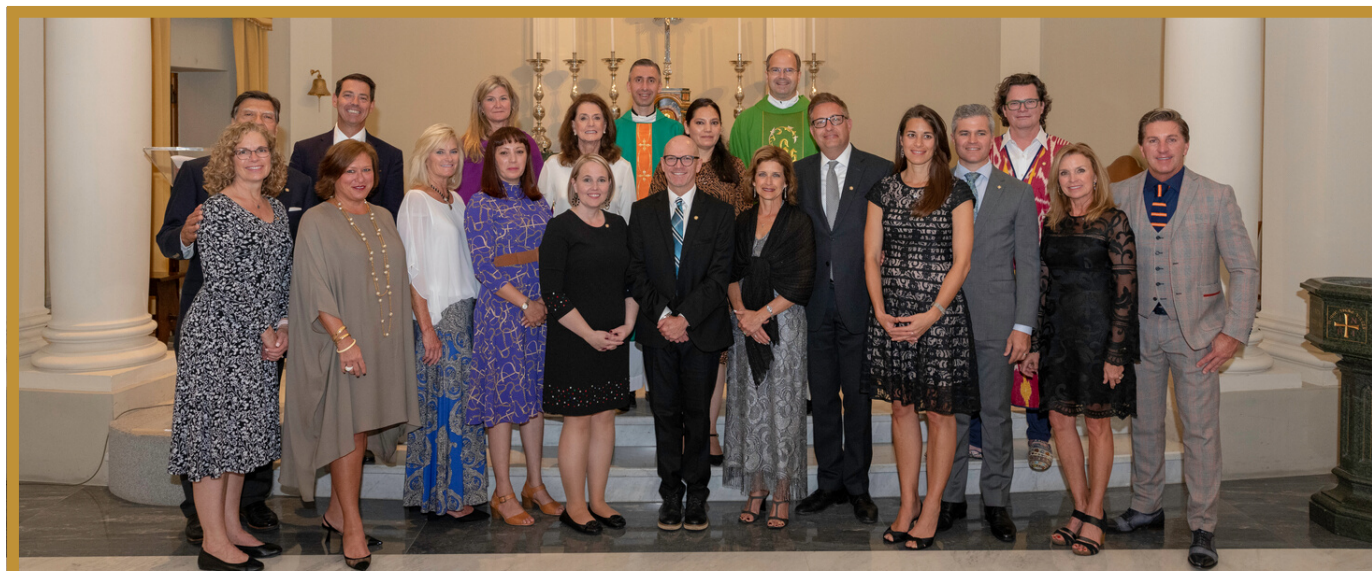
Texas Board members and Patrons experience a personalized tour of Rome.

Patrons of the Arts in the Vatican Museums