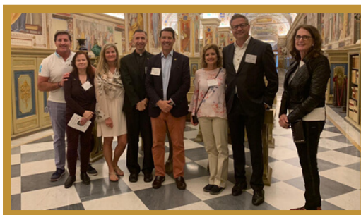
Above: Patrons visit the Sistine Hall of the Vatican Library, designed in the 15th century.

The Texas Chapter of the Patrons of the Arts in the Vatican Museums makes an official visit to the Vatican every other year. We would love for you to join us in 2021. Exact dates to be announced.