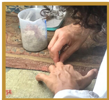
A restorer at the Vatican Museum removes worn thread from the tapestry.